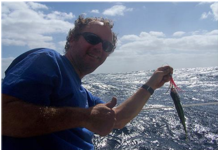
We caught a bunch of these little guys that we threw back to get bigger...

We were then able to secure a slip in the municipal marina that is quite inexpensive while we worked on a few projects and loaded up the Piper with as much beer and food as we could find room for.